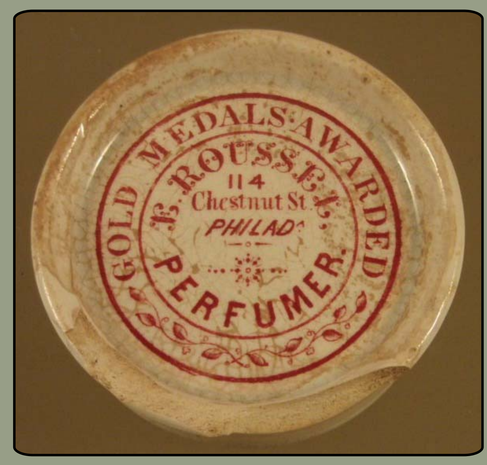
Apothecary Jar from Philadelphia