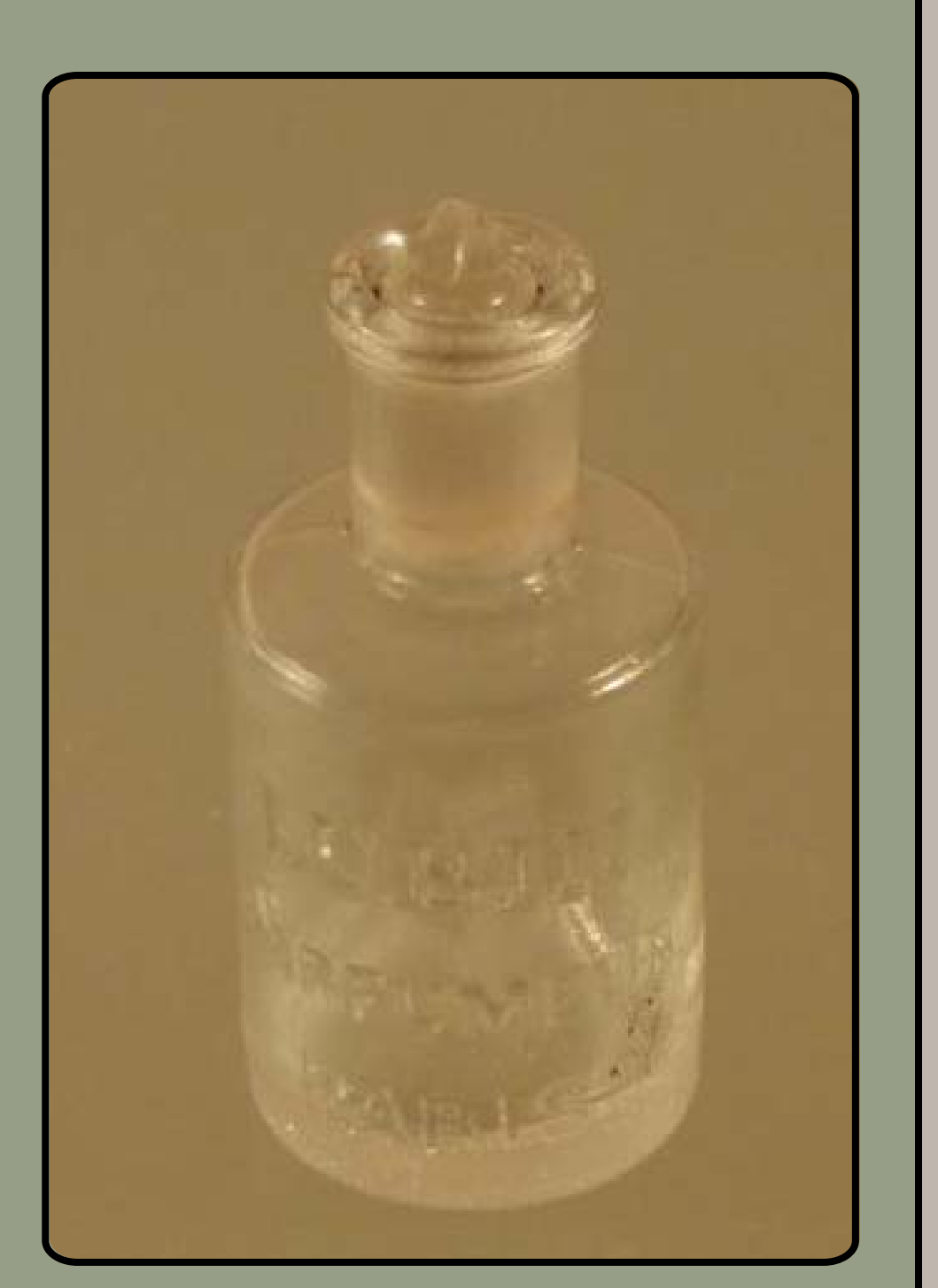
Perfume Bottle from France