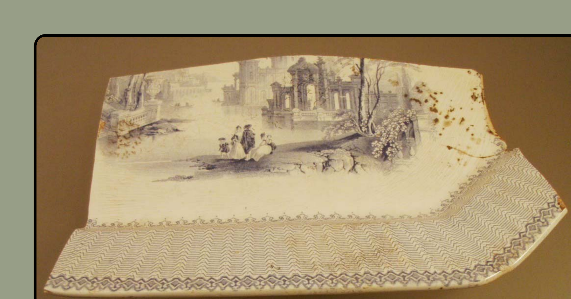
Serving Dish from England