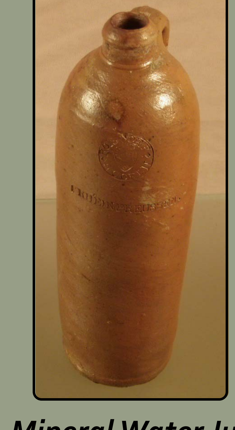
Mineral Water Jug from Germany