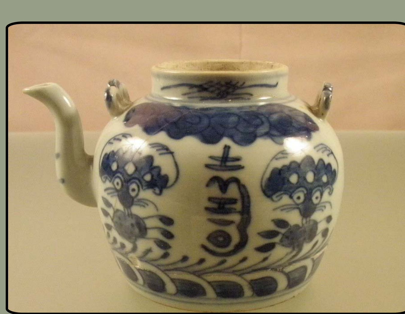
Teapot from China