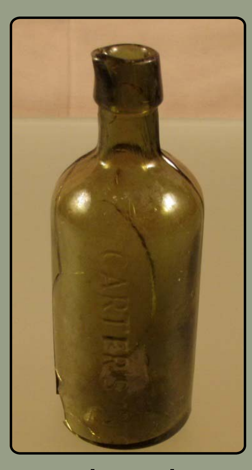
Ink Bottle from Boston

San Francisco was an international city and the recipient of goods shipped from across the world as well as across the continent. The people who lived during the 19th century within the footprint of the Transbay Transit Center project had access to items shipped from as far away as China, Germany, England, and Ireland, not to mention the major East Coast ports such as Boston, New York, Philadelphia and Baltimore. The objects pictured here were excavated by archaeologists during the project, and are on display in this exhibit.