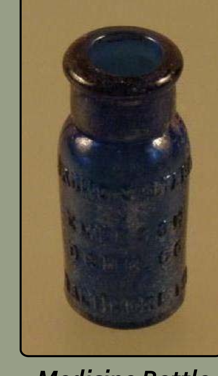
Medicine Bottle from Baltimore